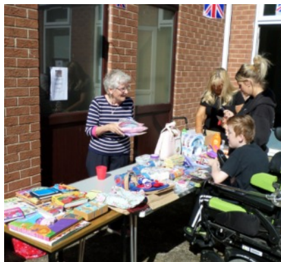
Florence's Amazing Stall